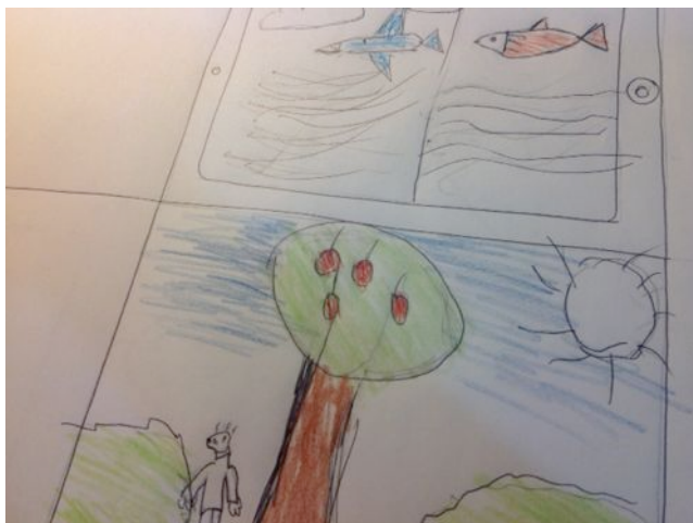
Figure 1. Storyboard fragment.

The workshop will be carried with a group of ten children, aged between eight and ten, and involves four phases: imagining, planning, developing, and implementing. The organizers will begin by introducing the activity and the materials to the children; afterwards children will be proposed to work in groups of two. Each group will get a large format drawing block, drawing material, a book with blank pages with embedded magnets, an iPad, and a stylus. From then on children take over the command. In the following hours participants are proposed to think about a story they want to create, and draw a storyboard (fig. 1), taking into account the kind of interaction they want to create between their drawings on the book and the digital content that will be displayed on the tablet device.