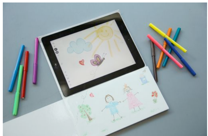
Figure 2. iPad displaying the drawing app, digital device with empty book, synchronized page (from top).